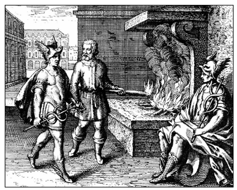
Alchemical Brass — Part 2